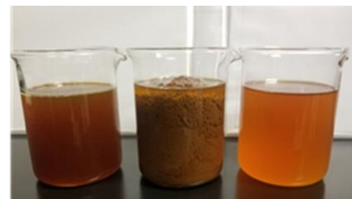
Chicken Fat (CF)