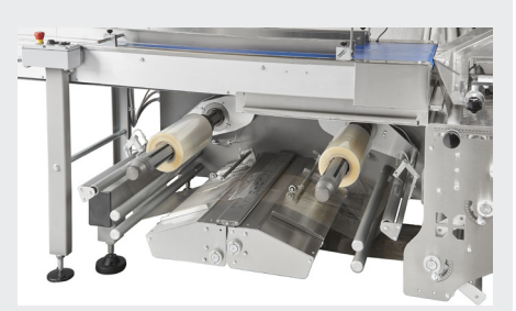
Automatic Reel-to-Reel Splice Option

BW Flexible Systems 225 Spartangreen Blvd. Duncan | SC | 29334 UNITED STATES t. +1 (864) 486 4000 bwflexiblesystems.com