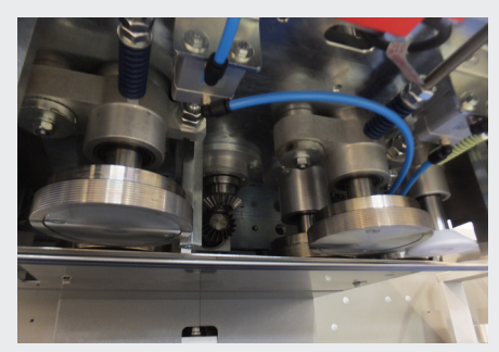
Overhead Sealing Wheels Assembly